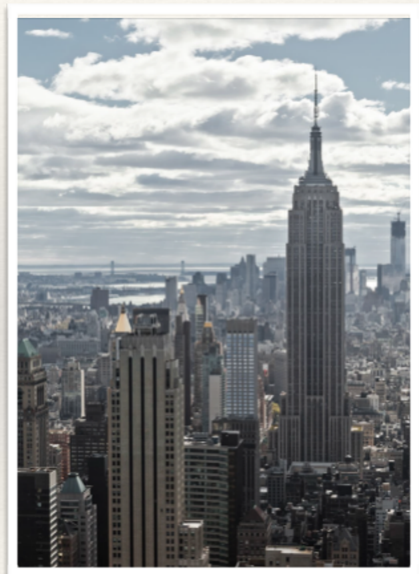
Guide: My private New York