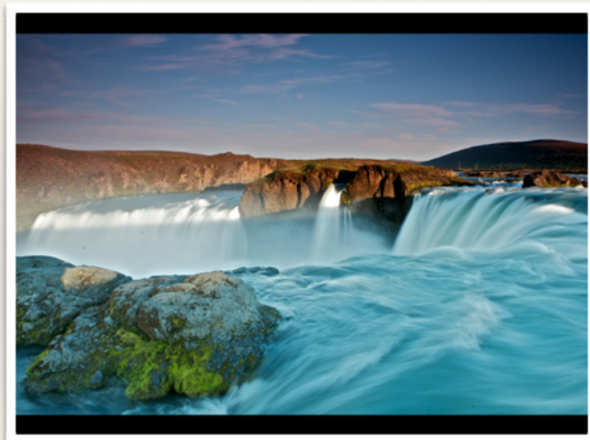
Guide: Magical Island