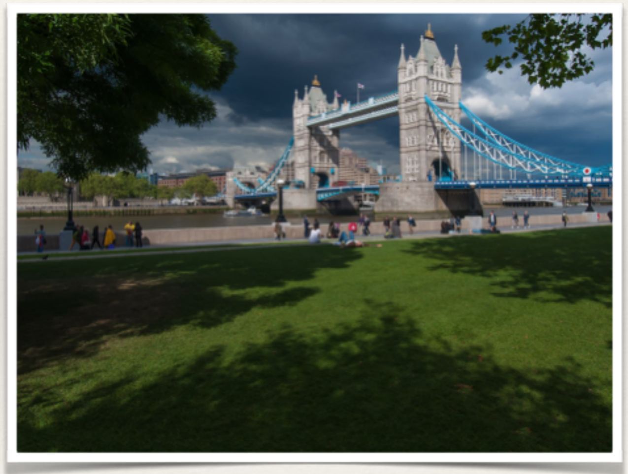
Guide: London, South of the River